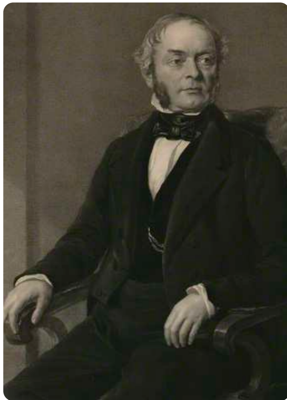
Samuel Wilderspin (1791–1866)

Samuel Wilderspin was a teacher who is known as the founder of infant education. He had enjoyed learning at home and looked forward to going to school. When he started school he didn't like the strict teachers or the boring lessons. He believed that children should enjoy school and be happy. He invented the school playground so children could play outside.