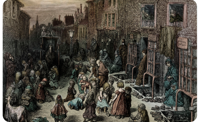
Poor Victorian families