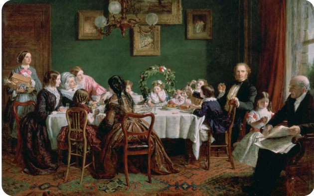
Rich Victorian family