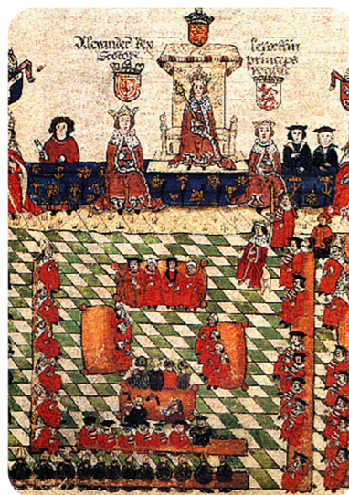
Edward I and the Model Parliament

The power of the monarchy has changed over time. In the past, some monarchs had absolute power. This meant that they could do whatever they wanted. Today, there is a constitutional monarchy. This means that the monarch is controlled by parliament and the government.