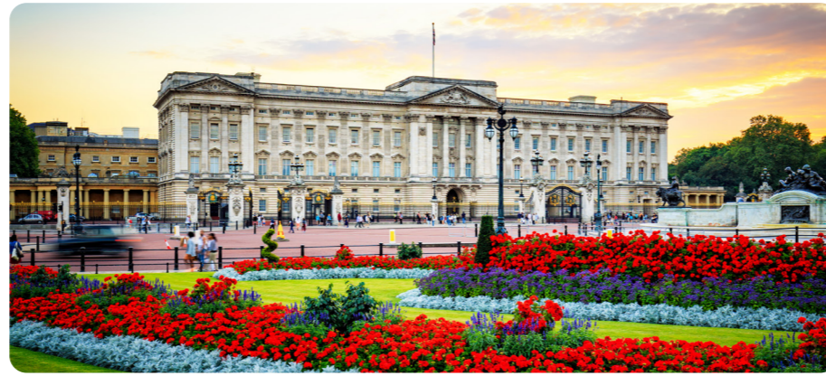
Buckingham Palace is in London, England.

Royal residences include palaces, castles and stately homes. Some of them are used for official royal business. Some are used as holiday or private homes. Many are tourist attractions.