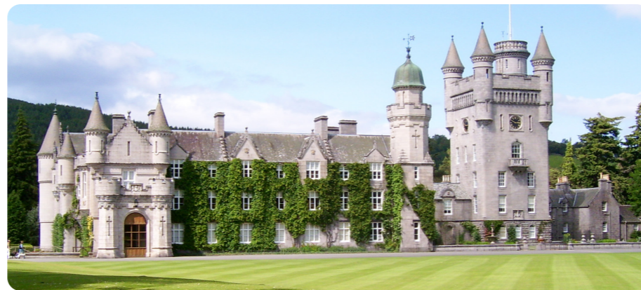
Balmoral Castle is in Aberdeenshire, Scotland.