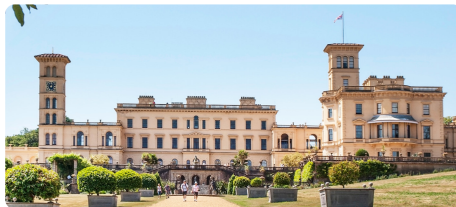
Osborne House is on the Isle of Wight, England.