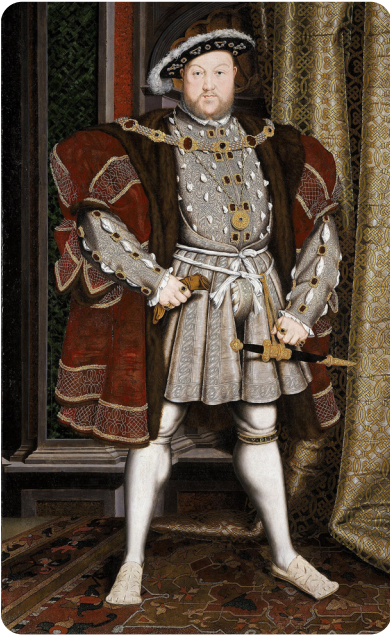
King Henry VIII

6. A long time ago, kings and queens made rules for the country.