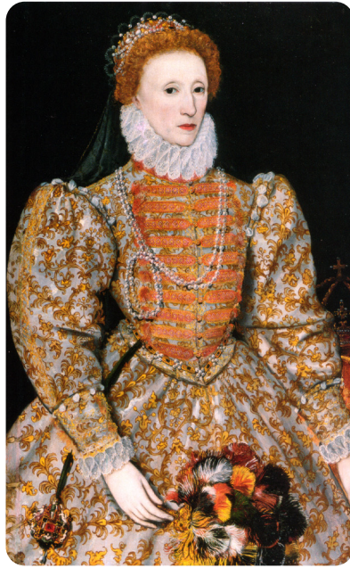
Queen Elizabeth I