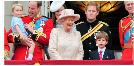
HM Queen Elizabeth II

Queen Elizabeth II is the current monarch of the United Kingdom. She was born in 1926 and became queen in 1952. The Queen is famous across the world.