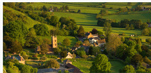
Village of Corton Denham, Somerset

The countryside is a rural area outside of a town or city. Less people live and work in the countryside than in a city.