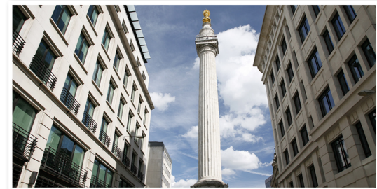
Monument to the Great Fire of London

The Great Fire of London was a significant event in London's history. It began in a bakery on Pudding Lane on Sunday 2nd September 1666. Many buildings were destroyed, including St Paul's Cathedral. Today, a monument stands near the place where the fire began.