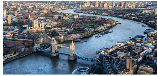
City of London

A city is a large urban settlement where lots of people live and work. There are many shops, restaurants, museums and theatres.