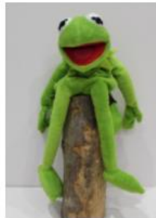
Frog on log

Challenge 7: Go round your house & take photos of objects which go together as rhyming words.