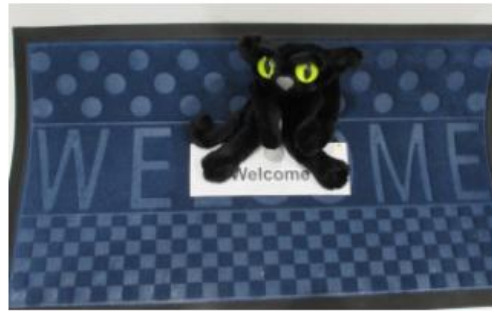
Cat on mat

Challenge 8: Make a list of your own rhymes using animals or children's names (ie. Fred sits on his bed, Nelly sits on the telly).