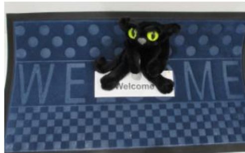
Cat on mat

Challenge 8: Make a list of your own rhymes using animals or children's names (ie. Fred sits on his bed, Nelly sits on the telly).